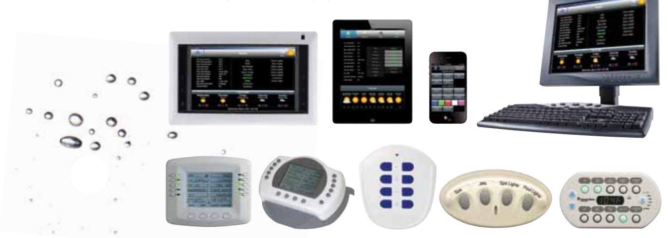
Photos show range of control devices available to interface with IntelliTouch systems—wired, wireless, push-button or touch screen—all are extremely easy to use.

For an overview of all the available ScreenLogic interfaces, see page 10.